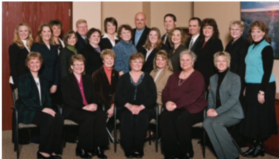
Southwest Initiative Foundation staff

We wish you the very best during this holiday season and the upcoming year!