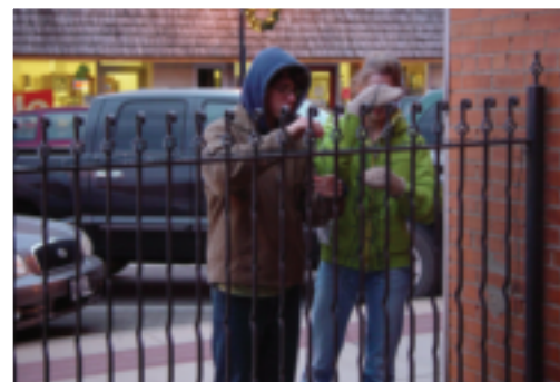
Students from Montevideo's YES team decorate downtown using solar powered lights.

Nearly 100 students and 20 coaches from throughout the region who attended the Youth Energy Summit (YES) at Prairie Woods Environmental Learning Center (PWELC) in Spicer this fall are now busy working on energy projects in their own communities.