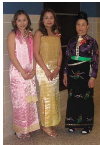
These people, who attended the premiere showing, were featured in the documentary film.

The goal of the film is to help promote communication and understanding among cultures and help people understand the personal journey of immigrants living in the region. The Collaborative hopes that other communities will use the film to promote discussion and integration. Copies of the film can be purchased for $12 from the Nobles County Integration Collaborative by calling (507) 376-3300.