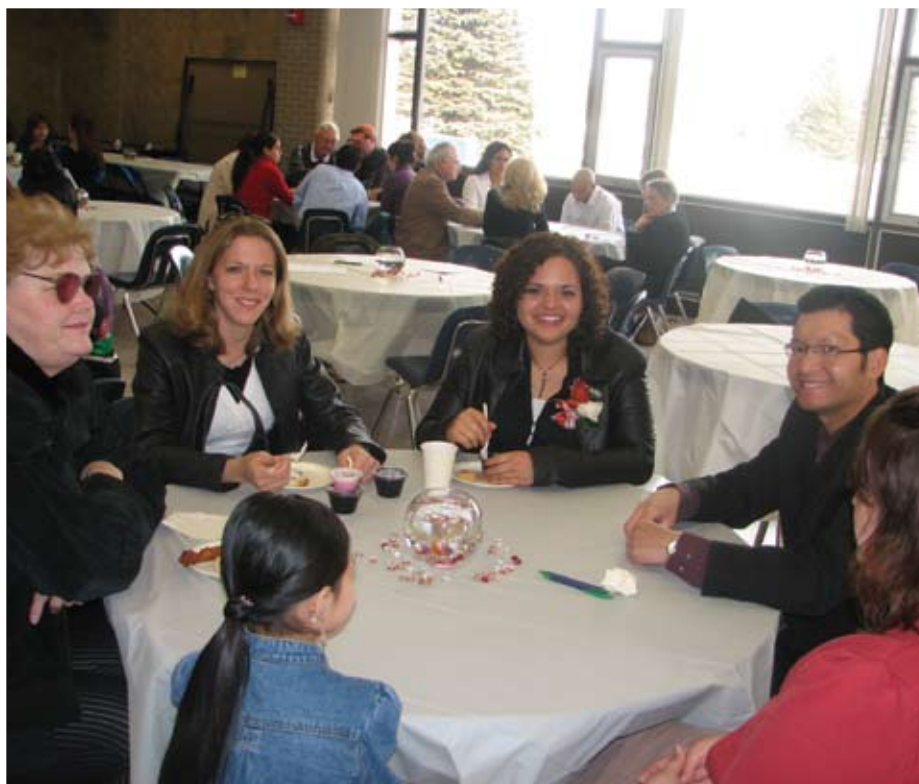
The premiere showing of the film created an opportunity for Worthington community members to get to know each other better.