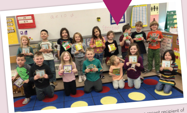
BOLD Schools Kindergarten and First Grade classes were a recent recipient of grant funds for their 'Science of Reading' books.

You don't have to be in local government to support this work! Make a gift in support of SWIF's economic development program by visiting bit.ly/SWIFinvestingtogether.