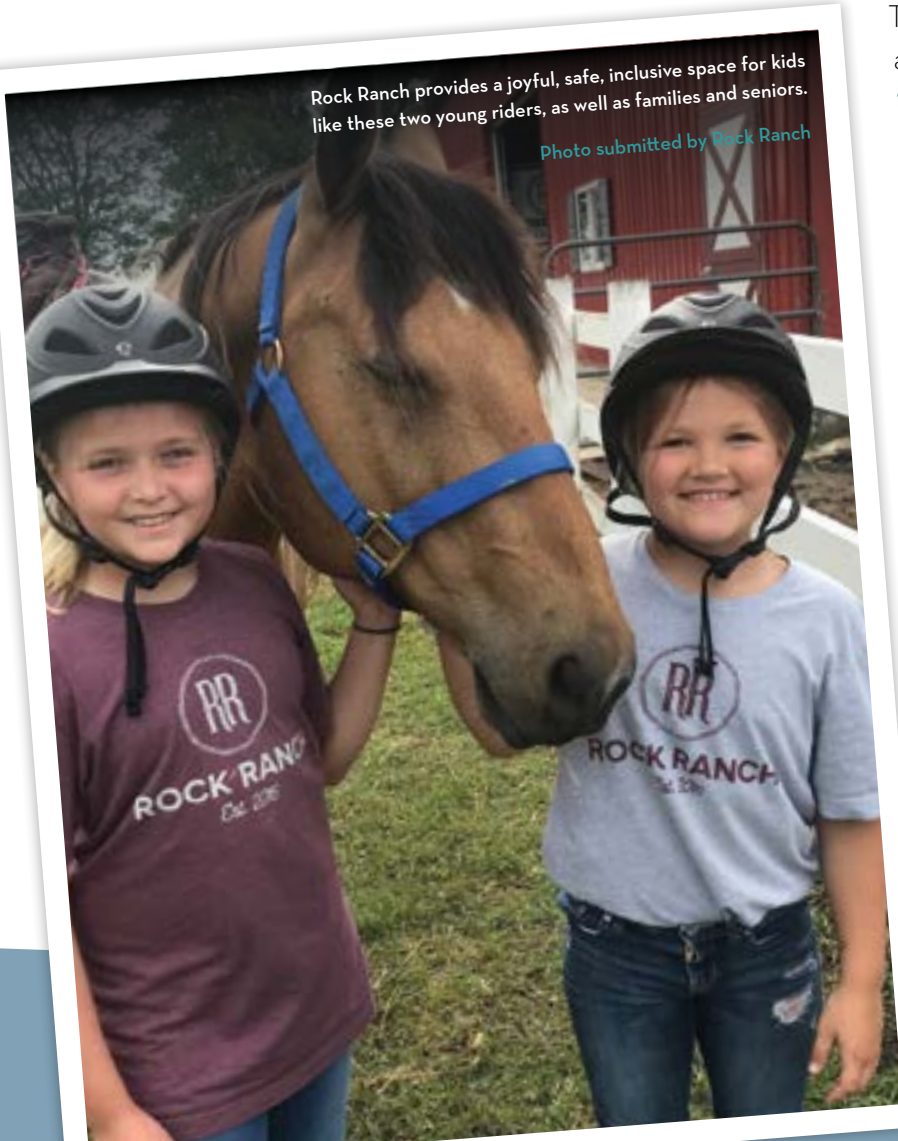
Rock Ranch provides a joyful, safe, inclusive space for kids like these two young riders, as well as families and seniors.

Support the future of southwest Minnesota with a monthly gift of $125. Visit swifoundation.org/growing-home-circle and then choose “Give Today.”